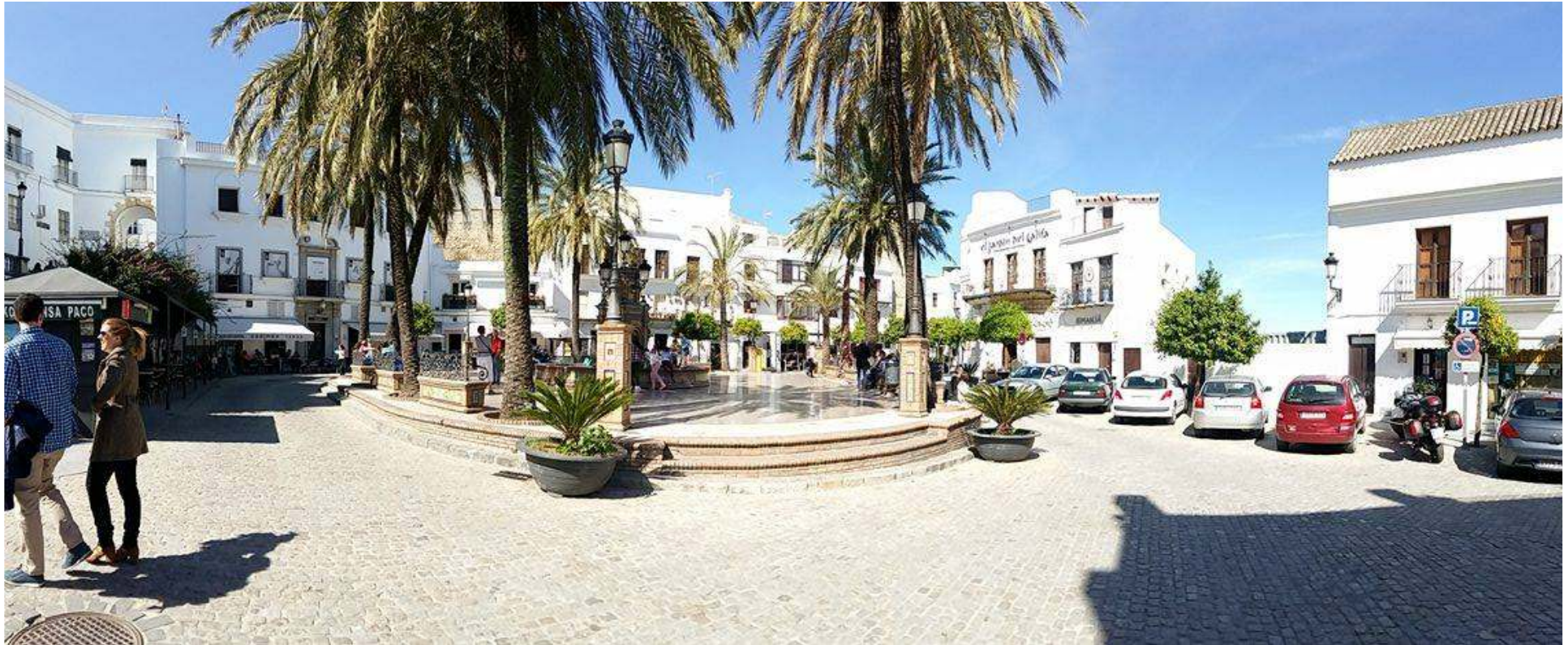
Fountain in the central square – the most beautiful place in Vejer de la Frontera