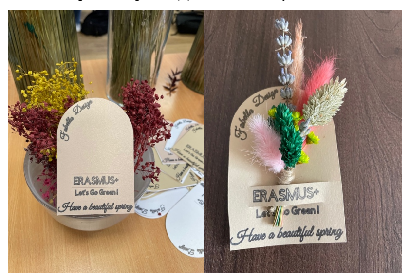
Workshop: making "mărțișoare" from recyclable materials

Working on the project results on international level participants improved communication in English language and vocabulary in environment related areas, IT, social and cultural skills. Also, they developed their critical thinking, teamwork spirit, responsibility for nature, sustainable attitudes, ecological and economic actions, in order to ensure comparable or better living conditions for present and future generations.